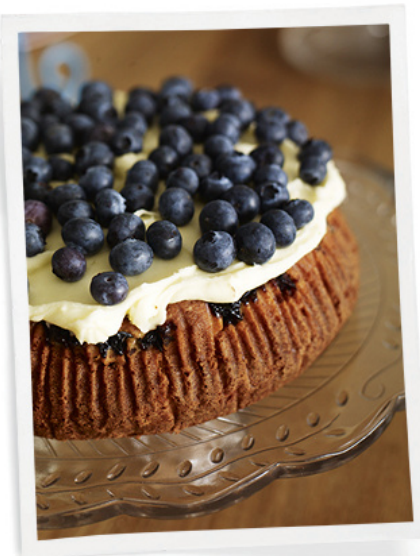
ABOVE: Coffee and baked goods, such as blueberry-and-sour cream cake, are served in the café. RIGHT: Rosamund and shop staff host monthly book clubs and visits with best-selling authors.